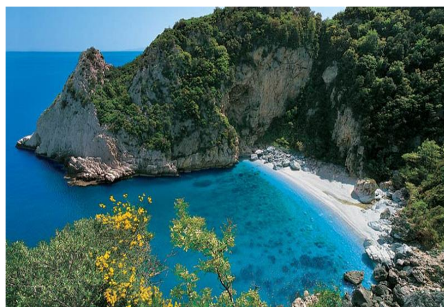
Unspoiled Fakistra beach listed by "The Guardian" in the top 10 european beaches reached on foot (Aegean sea – Tsagarada)