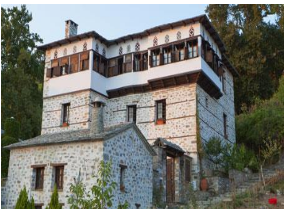
Traditional Pelion mansion – Milies village