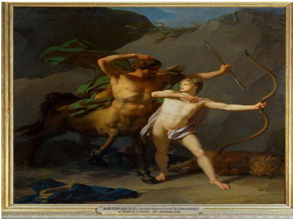
Centaur Chiron educating young Achilles

Join us on a spectacular full day tour exploring both sides of the Pelion peninsula (east and west), having the chance to admire both the Aegean sea and the Pagasitikos gulf, a place where the legendary Jason and the Argonauts started their sail to the edge of the known world in search of the Golden Fleece. A mythical mountain, home of the mighty centaurs, birthplace of Achilles, mythical hero of the Trojan War, greatest warrior in Homer's epic poem "Iliada".