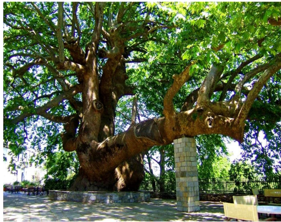
Famous 1000 years old plane tree in Tsagarada

Tsagarada is one of the oldest and most appealing villages of east Pelion (altitude 500 m). It was founded in 1500 ad in a wild chestnut forest. Set in a panoramic position in a lovely hillside area, it offers amazing views over the deep blue Aegean sea. It is harmoniously integrated in lush vegetation with magnificent mansions, traditional cobbled paths, stone-built fountains and beautiful squares.