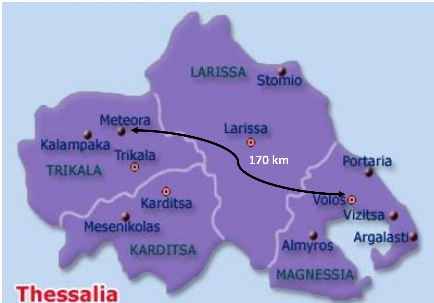
Thessaly Prefecture Area Map